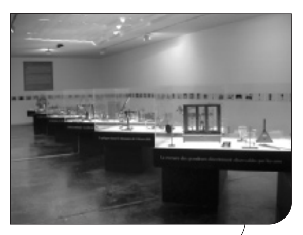
Fig. 2. Collection of scientific instruments from the University of Sciences and Technology in Lille: temporary exhibition at the Espace Culture of the University, April 2004.

Universities also have collections that are not housed in a museum and these are undoubtedly in the majority. Typically, these are found in departments, institutes, astronomical observatories or other facilities. In Europe, some important examples are the Palaeontology Collections at the University of Lyon Claude Bernard, the Animal Sound Archive at the Humboldt University in Berlin, the collection of scientific instruments at the École Polytechnique in Paris, the Egas Moniz Collection at the University of Lisbon, and many others, including almost all herbariums. Conditions of public access vary - some collections are displayed in a permanent and