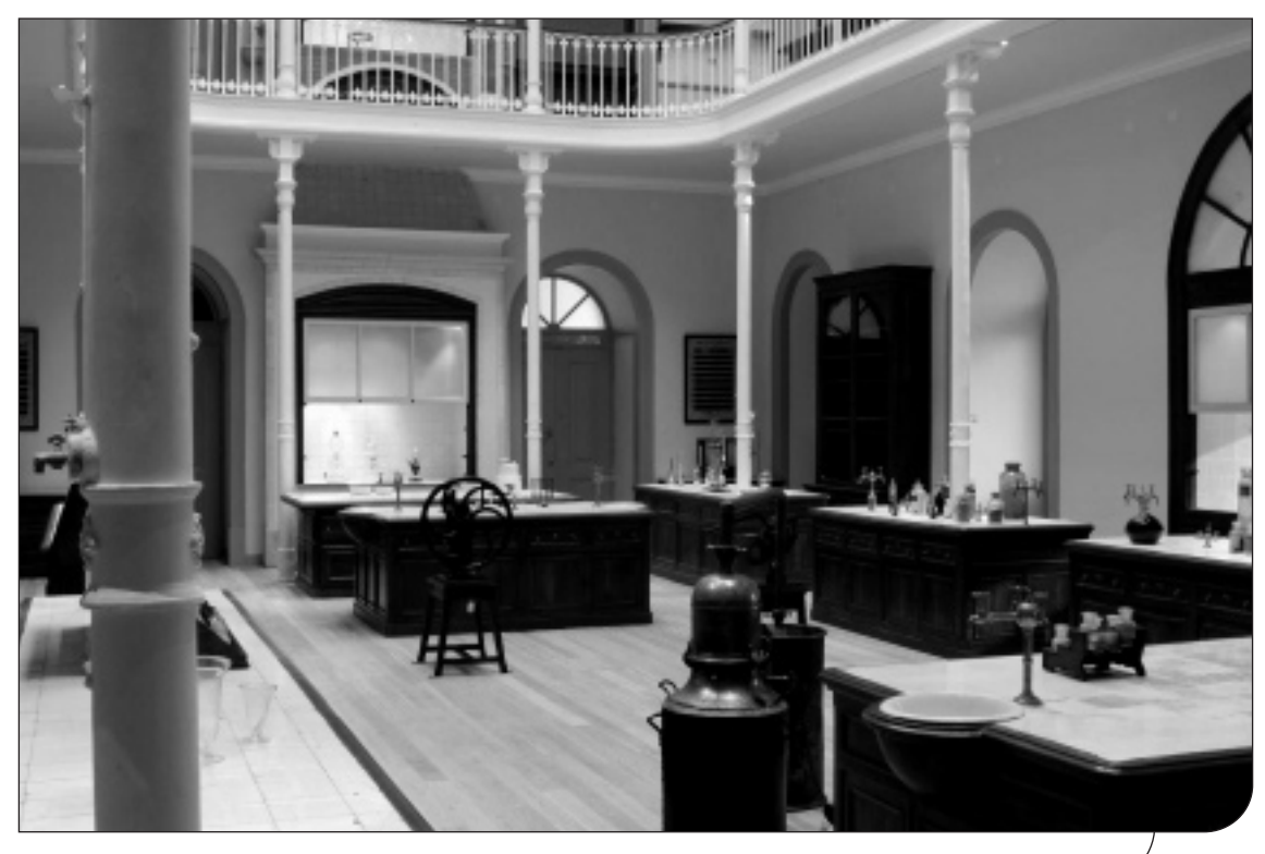
Fig. 5. The 19th century Laboratorio Chimico, recently renovated.