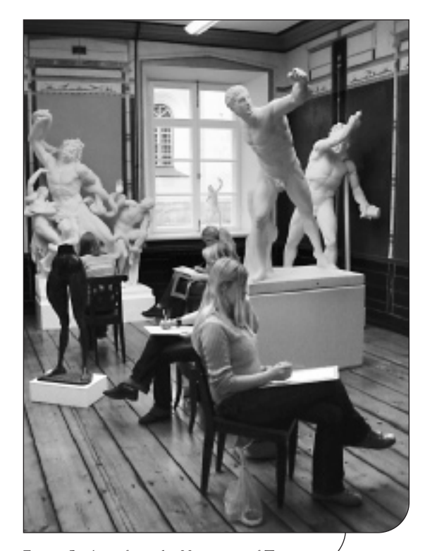
Fig. 3. Students from the University of Tartu (Estonia) at the University Museum of Art, December 2003.

understood without understanding universities for the simple reason that they are planned, built, directed, organised, expanded, neglected and dismantled by professors, researchers, students, rectors, librarians, and alumni (fig. 3). If the nature, history and modus operandi of universities are not taken into account, one is likely to find the complexity of university museums and collections overwhelming, the reasons for their existence chaotic and arbitrary, and their public performance well below standards. One can and should benchmark against the museum sector, but one can do so only once the significance of university collections is more clearly understood. This is essential and not always appreciated, both by those looking from "the outside" and by those looking from "the inside". This is the first problem of university museums and collections.